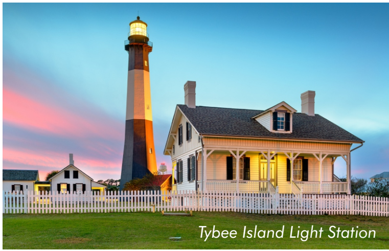
Tybee Island Light Station