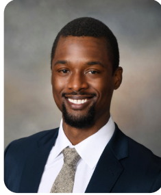
Harrison Barnes NBA Player and Philanthropist